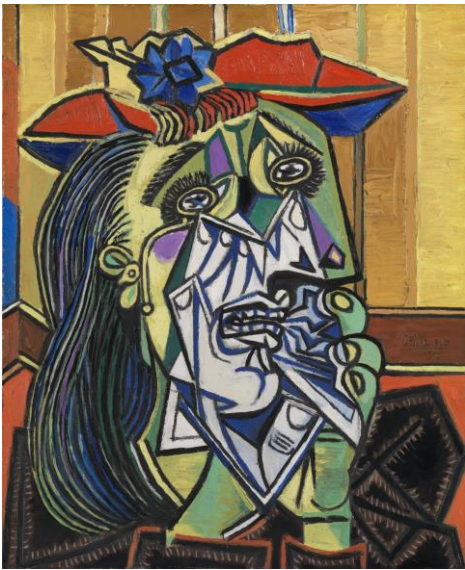
The Weeping woman, 1937